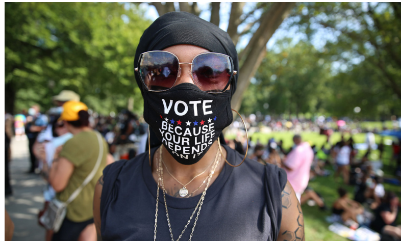
57th March on Washington